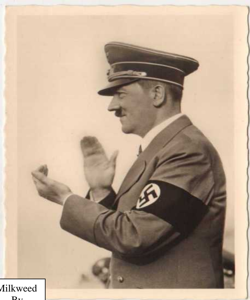
Milkweed By Jerry Spinelli